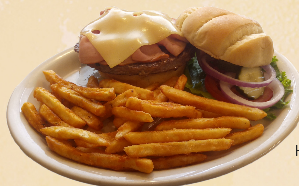
Ham Dinger Burger

Burger with Ham & Cheese. 1/2 lb $13.99 1/4 lb $11.99