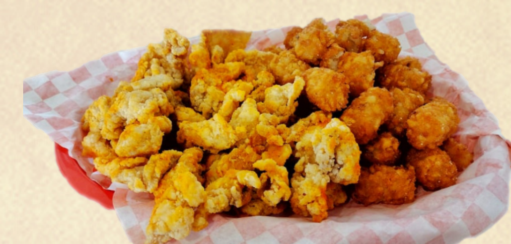
Chicken Cracklin & Tots