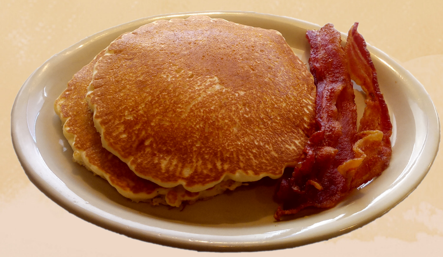
2 Pancakes with Bacon

1 Pancake. $5.99 2 Pancakes. $7.99 Served with Bacon, Sausage or (Ham +$1.00)