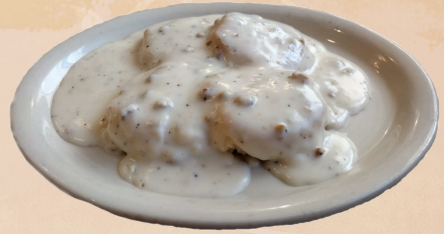
Biscuits & Gravy

Vegetable Peppers, Onion, Tomato, & Mushrooms. Served with Hash Browns & Toast. $9.99