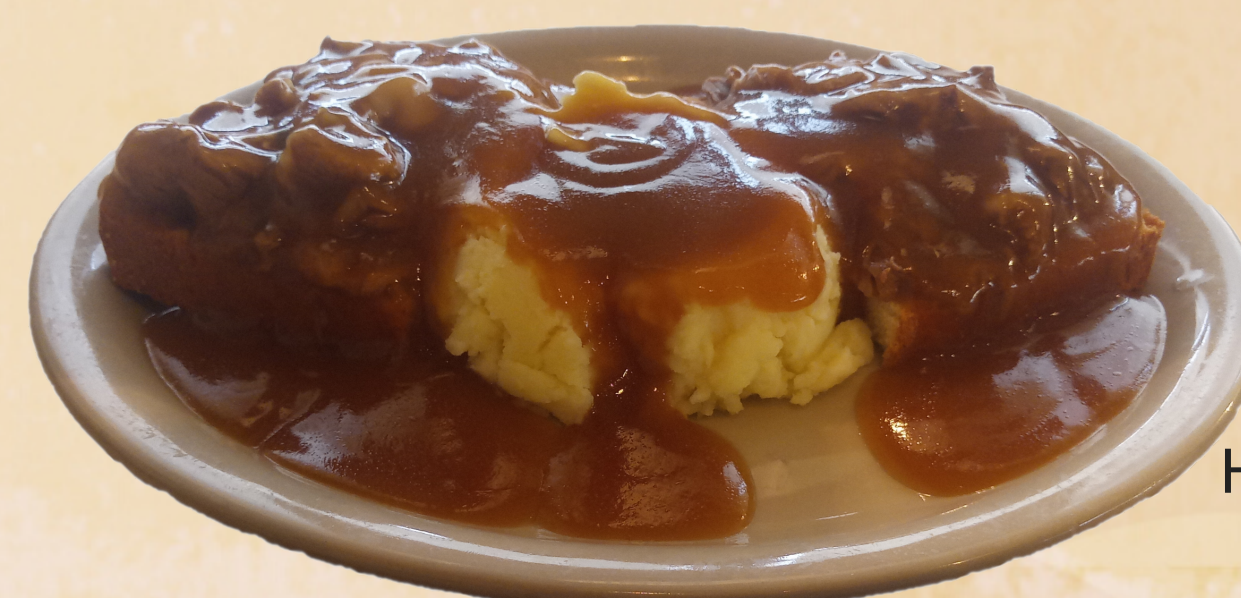
Hot Smoked Beef

Served Open Faced on White Bread Smothered in Brown Gravy. Served with Mashed Potato. $11.99