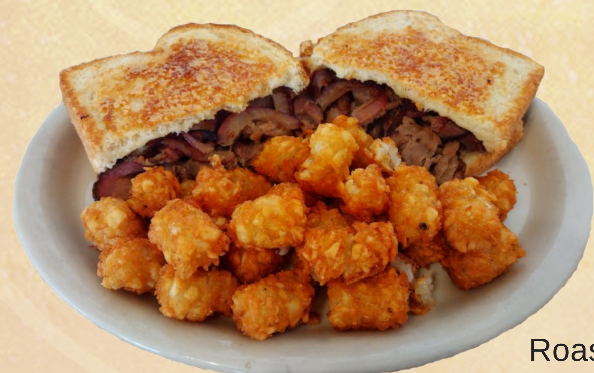
Roast Beef Melt

All Sandwiches Served with Fries Add Soup & Salad Bar $4.99